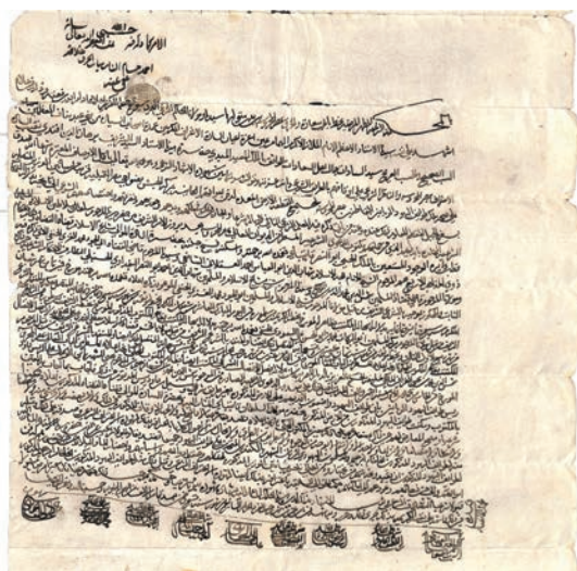
An Ottoman court document from 1649 confirming the Jewish community's right to the land of Basatin going back to the rule of Sultan Qaitbay

into middle income government-subsidized housing – an extension of the expanding affluent residential neighborhood of Maadi. Beginning in the 1980s, if not earlier, the majority of tombstones and mausoleums in the cemetery were also stripped of their marble, granite, and metal fixtures for reuse. Then, in the late 1990s, the cemetery was bisected by the construction of the Cairo Ring Road.