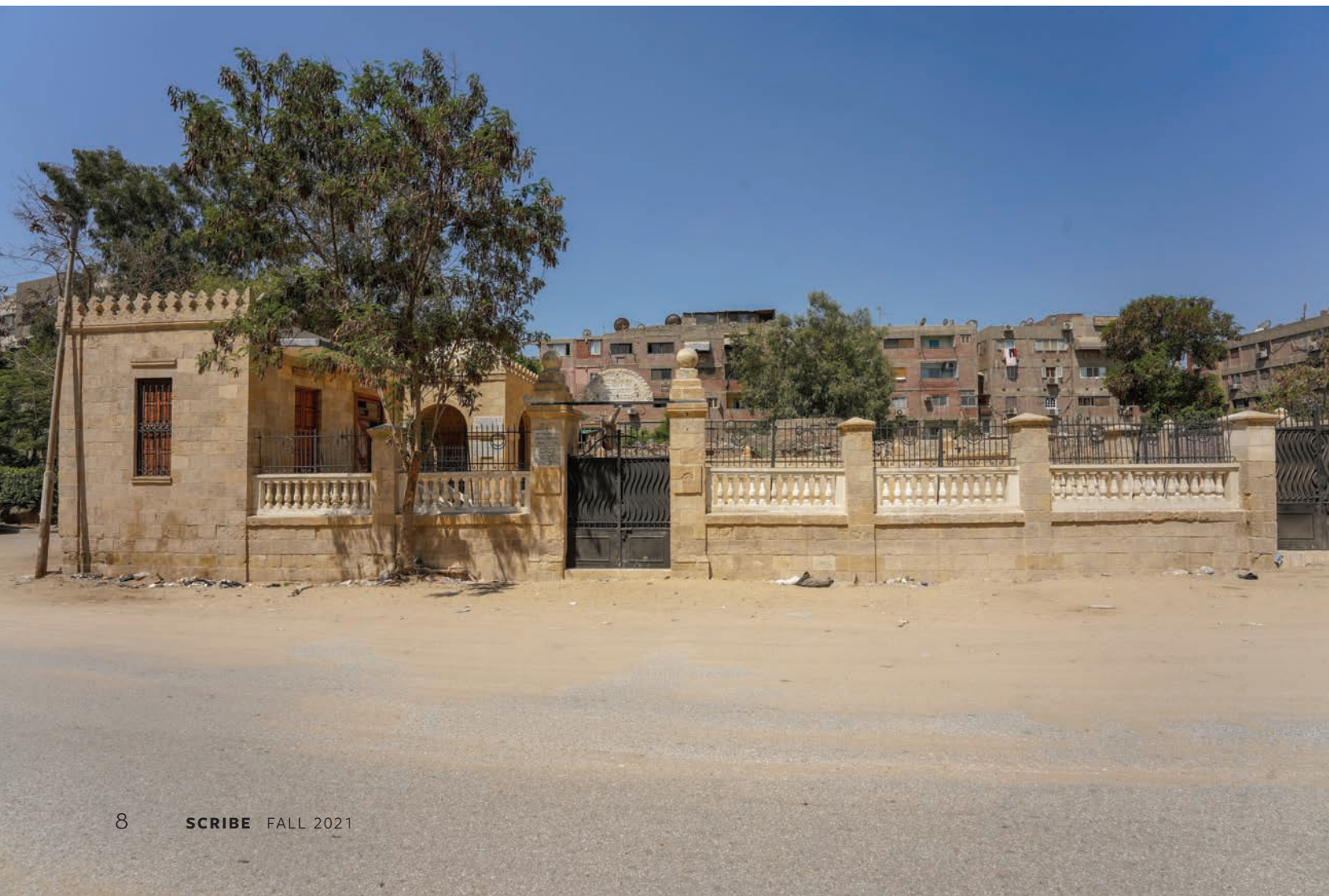
Street view of the Menasha cemetery, following restoration

Without a population to maintain and use purpose-built spaces such as the cemetery in Basatin, it quickly fell into disrepair and was encroached on. Beginning in the 1980s, the northern and eastern areas of Basatin were slowly converted into informal settlements and workshops for marble and stone masons and their families, built directly over large swaths of the cemetery, while the south was developed