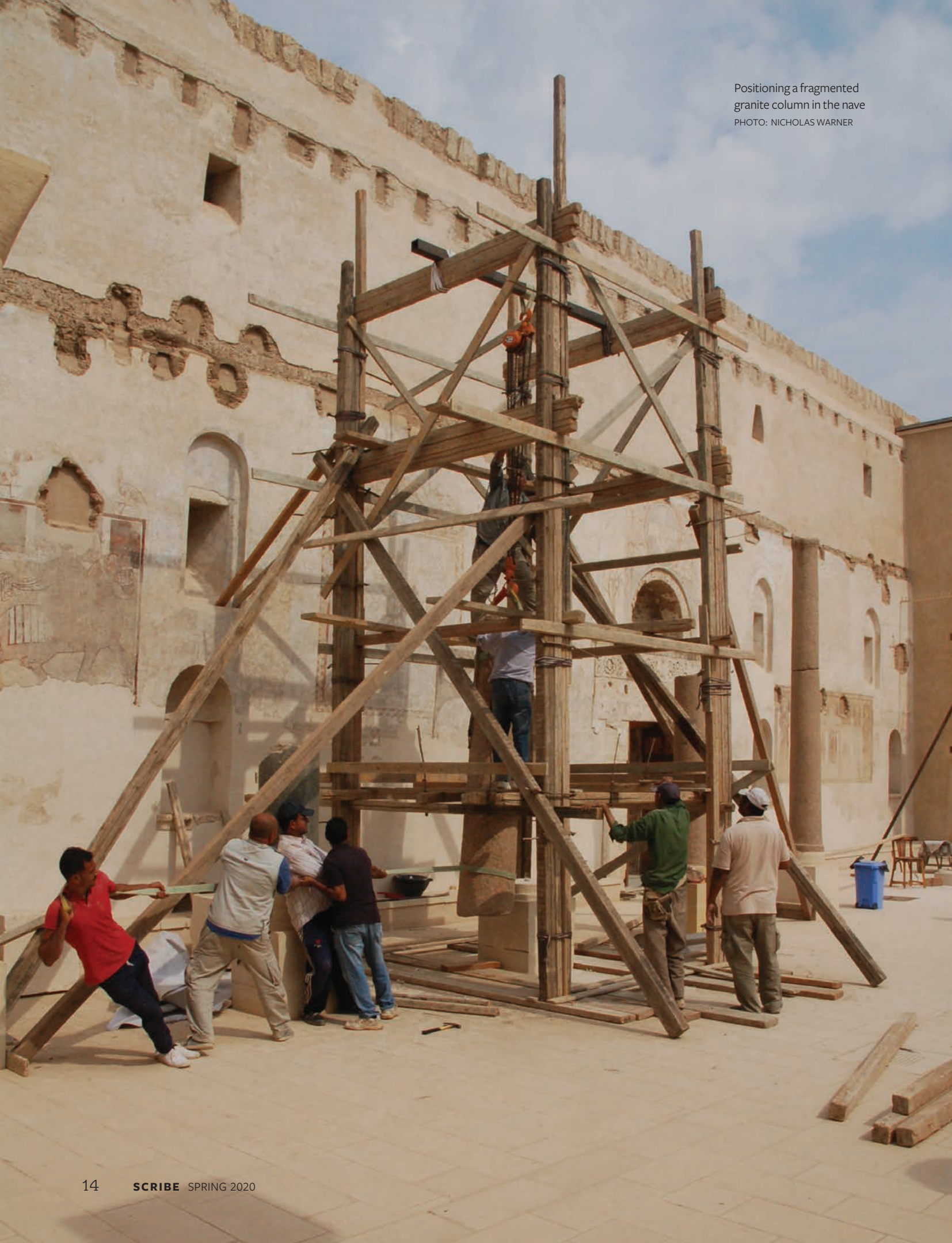
Positioning a fragmented granite column in the nave