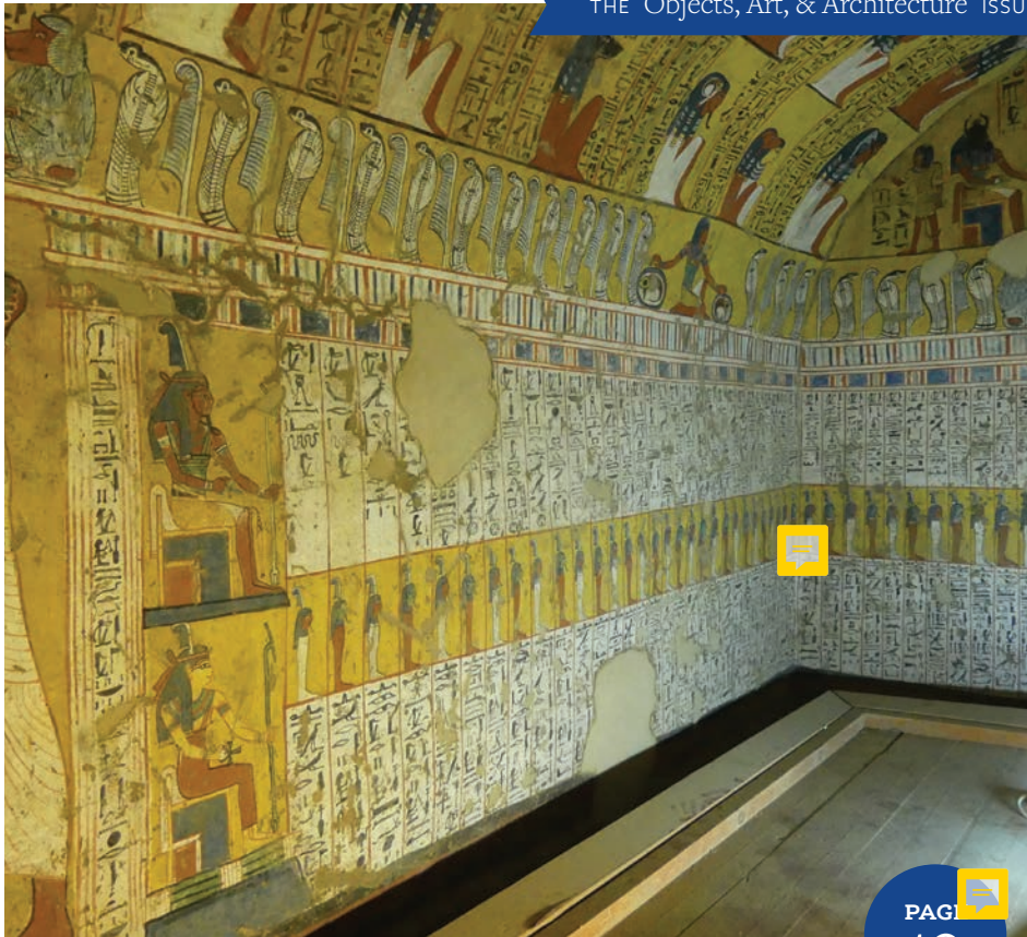
Scene from the burial chamber of TT 219 (Nebenmaat) showing the senet tableau from BD 17, the deceased couple as ba-birds, and the BD 59 tree goddess scene