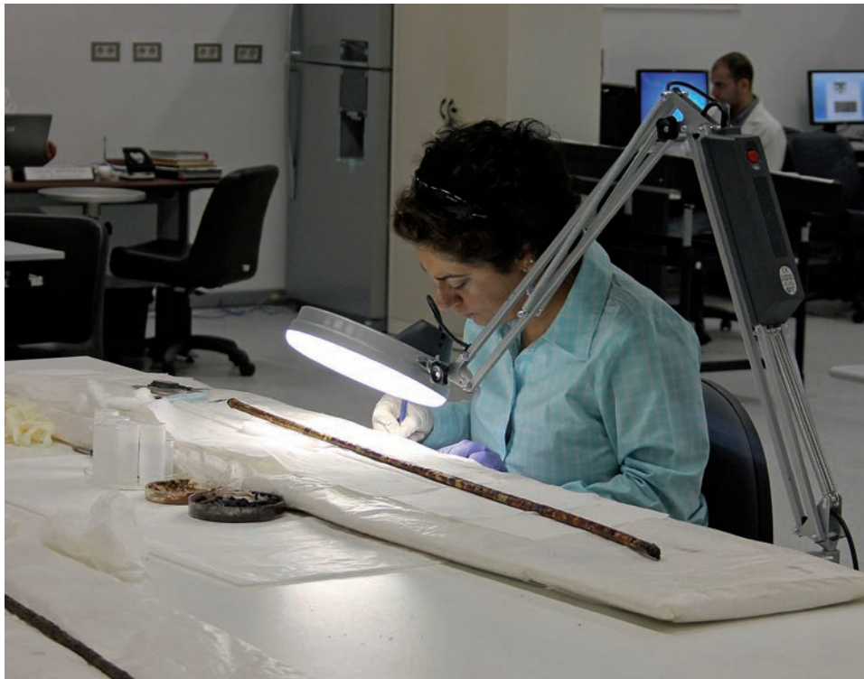
ABOVE: Documenting the sticks was a time consuming task

The condition of the sticks and staves varied greatly. For example, those made of (mainly) gold with inlays are in good condition. However, those made of more perishable materials, such as wood and leather, were in much worse condition due to the deterioration that was caused, among other factors, by the high humidity levels in the tomb. Carter writes extensively about the damage in his notes, and explains why some heavy-handed consolidation using paraffin wax - which was standard procedure at that time - had to be carried out.