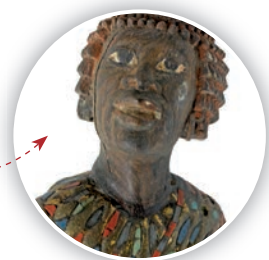
FROM L-R: A) Stick o48b with a curved handle in the shape of a Nubian foe with his arms tied behind his back; inset: Detail of the handle; B) Stick o50uu with a curved handle in the shape of a Nubian and an Asiatic foe; Inset: Detail of the faces of the foes; C) Carter Number o48c, Detail of the Nubian foe.