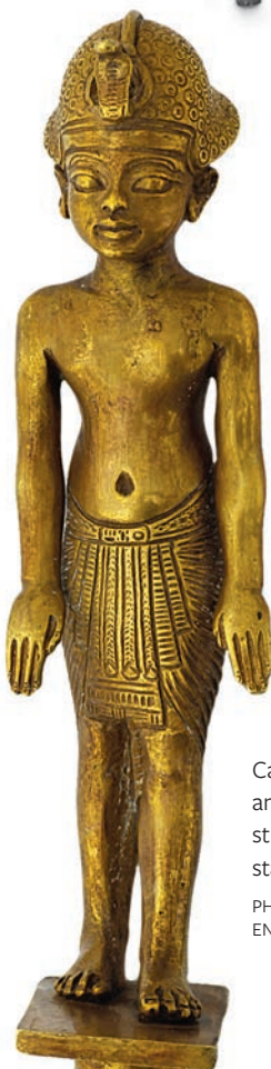
Carter Numbers 235a and b. A silver and gold stick surmounted by a statuette.