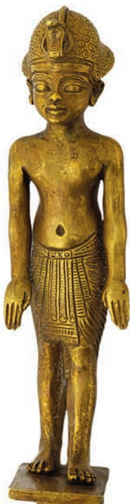
A gold stick surmounted by a statuette